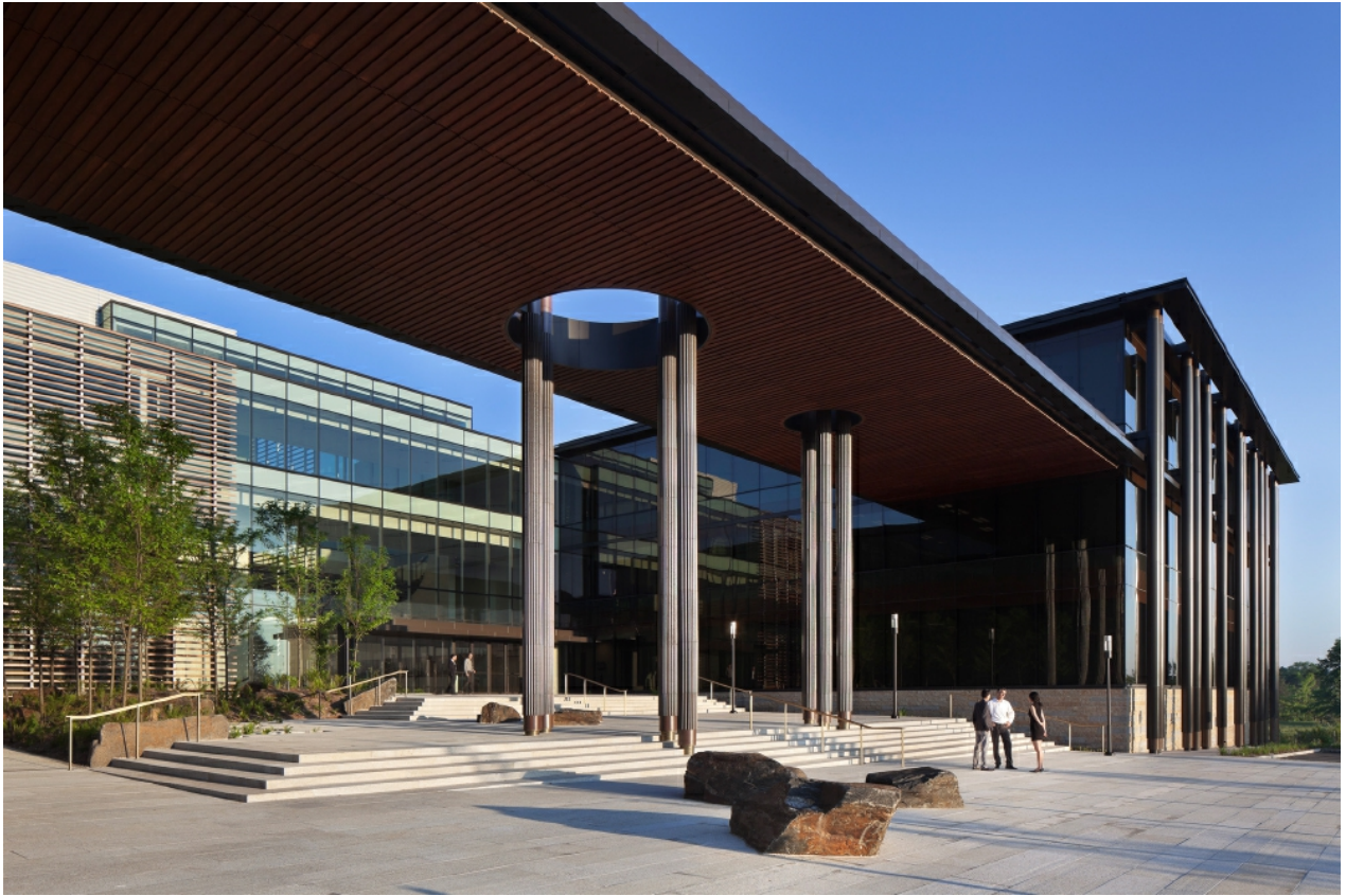
Entry courtyard and stairs.