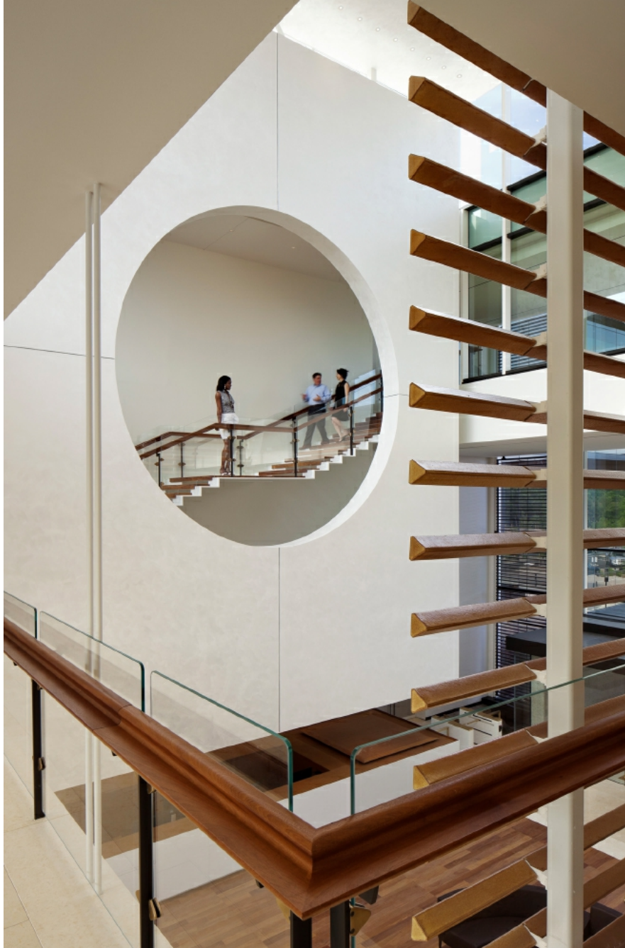
The Realogy Headquarters building, designed by KPF, is organized around a glazed, multistory atrium.

The new Madison, New Jersey headquarters for Realogy Holdings Corporation, a real estate franchising company, is a warmly toned, welcoming building whose glass-dominated wings enclose a courtyard. Kohn Pedersen Fox