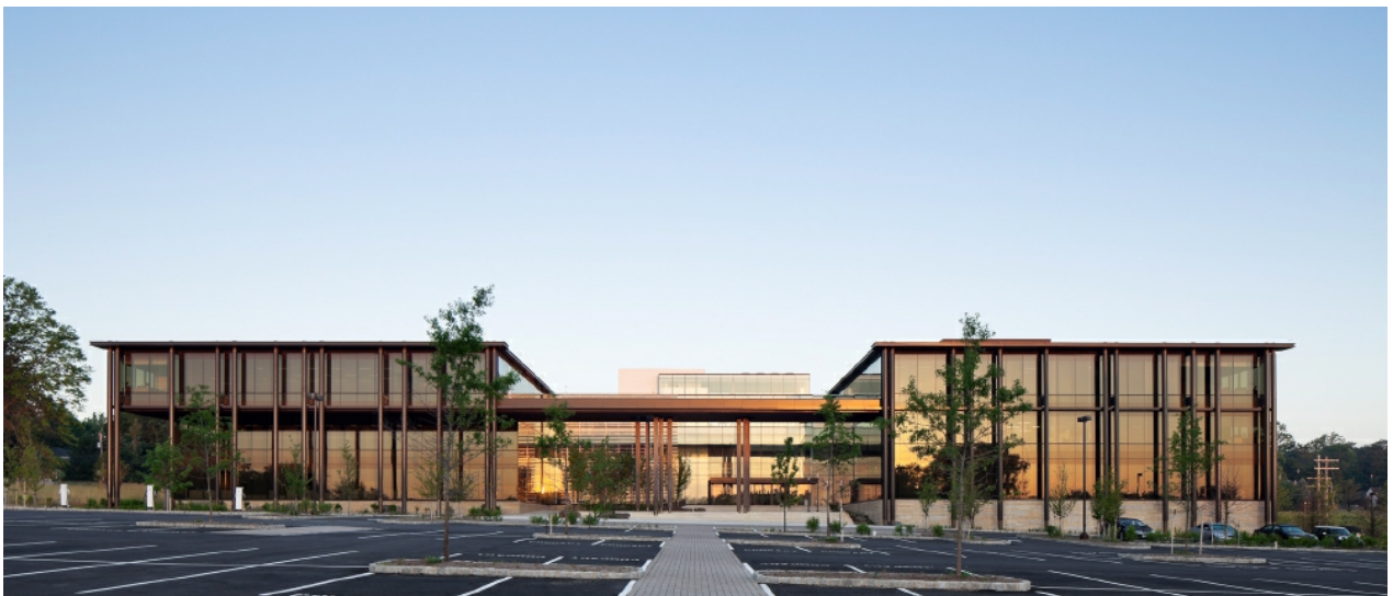
East facade view.