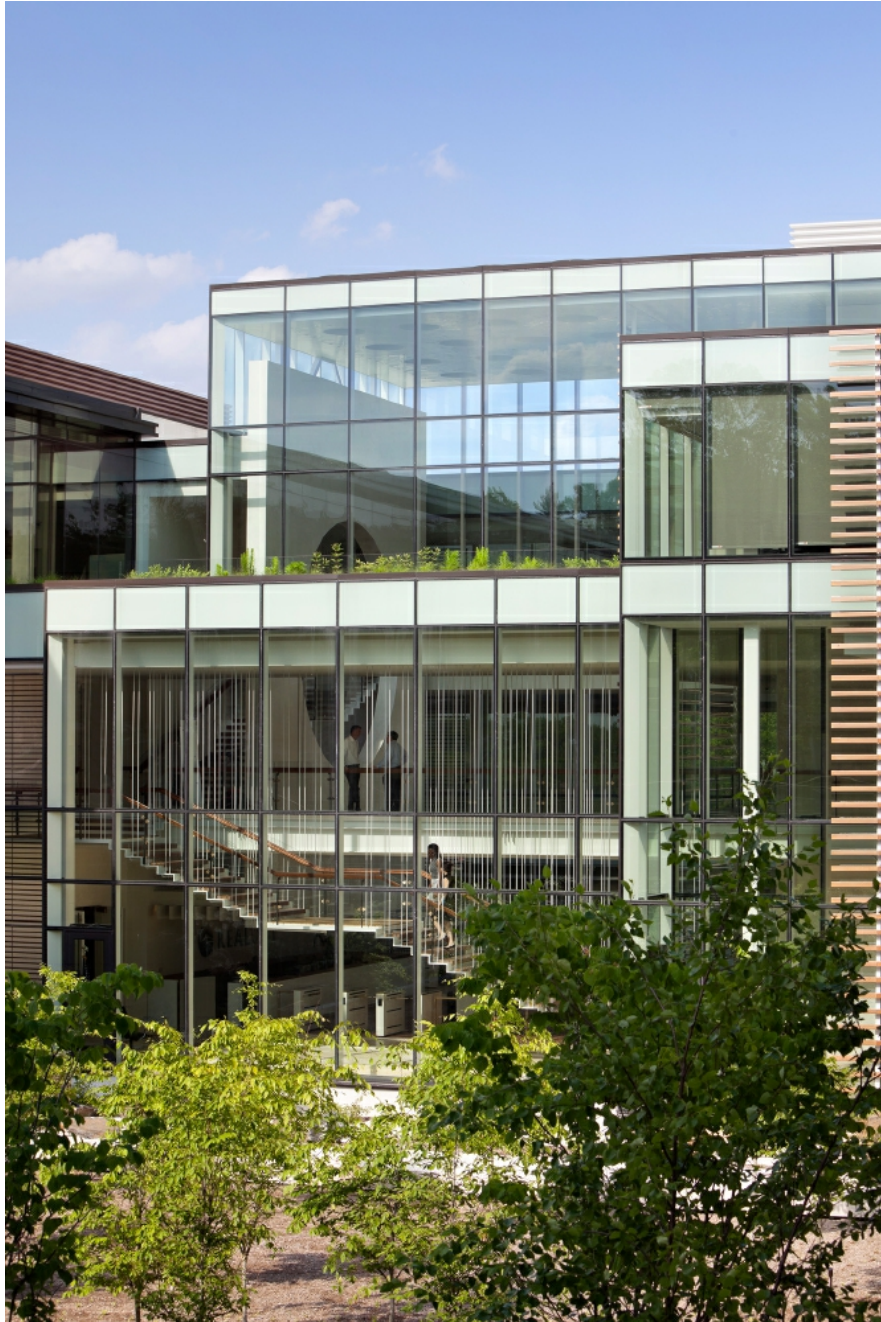
The western lobby facade and stair, seen from across the courtyard.

connected covered, open-air colonnades that enclose the two courtyards.