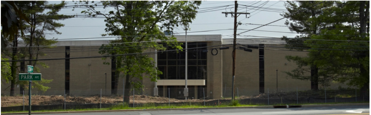
Before and after views of the Realogy Headquarters western facade.